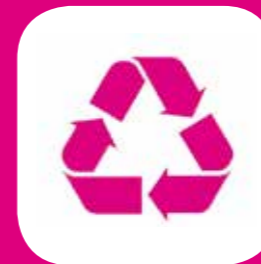
Waste Disposal Logistics