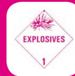
Transport of Hazardous Goods