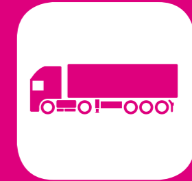
Full Truck Loads