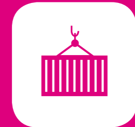
Heavy and Oversized Transport